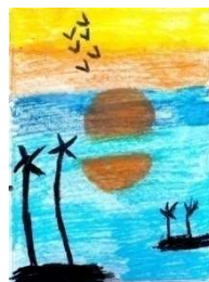
Sunakshi Tiwari Class-4 (A)