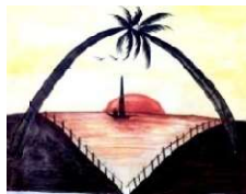
Jagrati Kursija Class - 4(A)